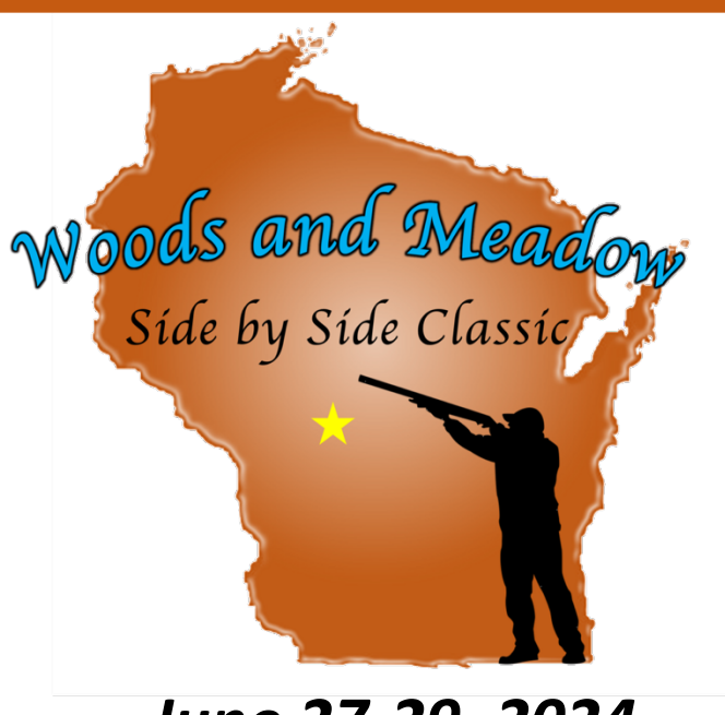
June 27-29, 2024

Welcome to the first annual Woods and Meadow Side by Side Classic! We are excited and grateful to take over this event from Duluth Double Gun. We know we are new to the side by side world, but we will try our best to continue this tradition. Many thanks to the Duluth organizers for their help and for thinking of us to host this event!